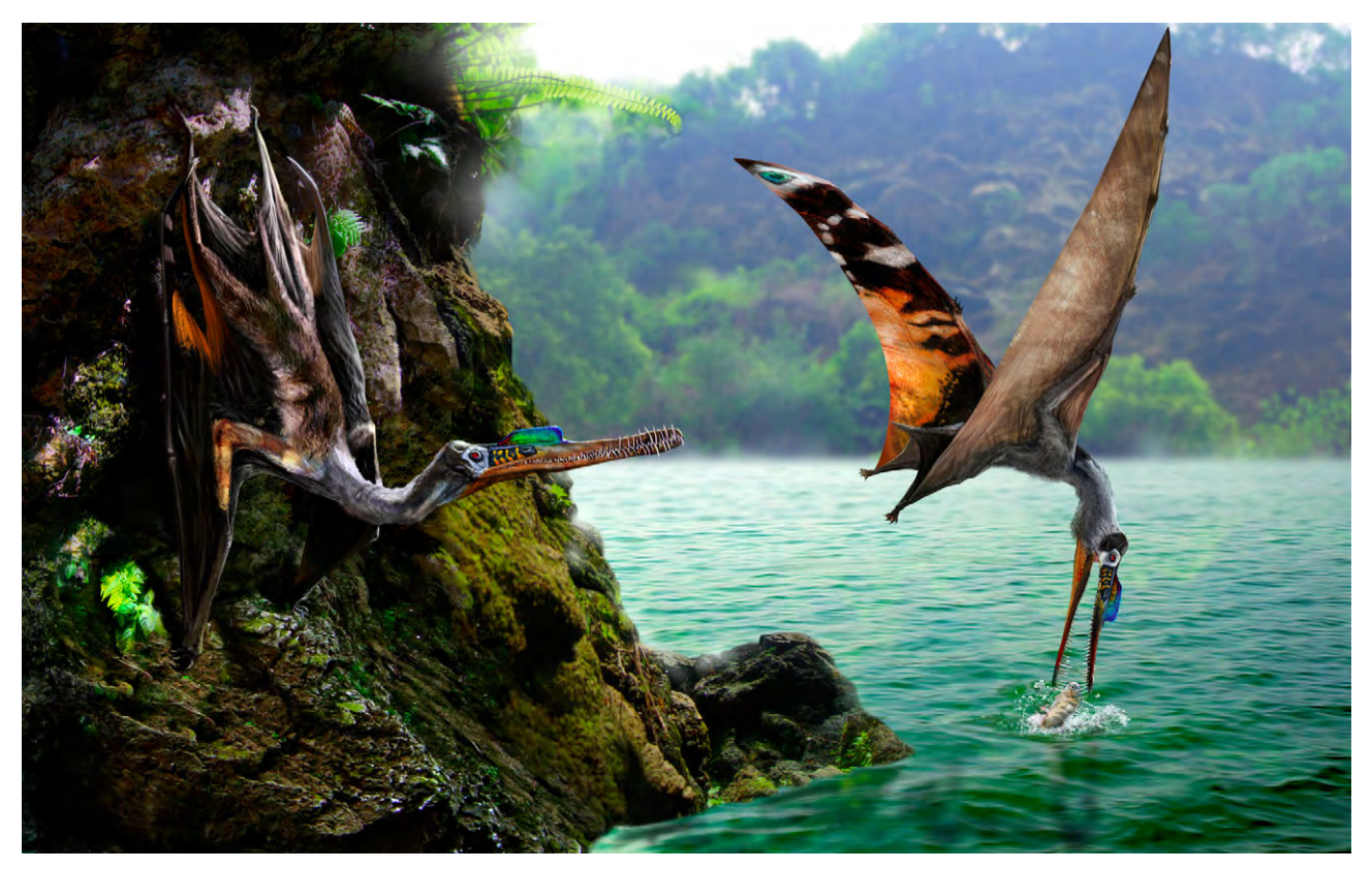
Fig. 3. The living scene of Zhenyuanopterus (Drawn by Zhao Chuang)

This new specimen provides new information on Zhenyuanopterus . For example, it is inferred from the new specimen that the forelimb is more robust than the hindlimb, and that the total number of the caudal vertebrae is 15. Another fact worth mentioning is the skeleton's ontogenetic change during growth: the scapula and coracoid begin relatively larger than the humerus and femur. The humerus and femur grow at the same rate, which means that the length ratio of the humerus to femur is constant. Both the holotype and the specimen (XHPM1088) have a robust forelimb and weak feet,